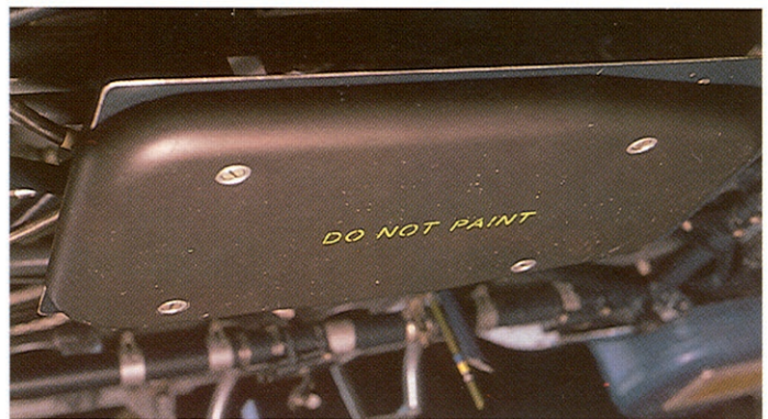
Loop antenna for ADF receiver