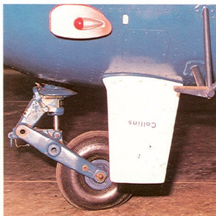
Antenna for VUC-201A