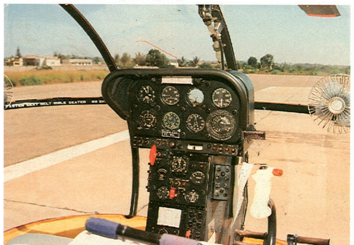
Fans to enhance passenger comfort