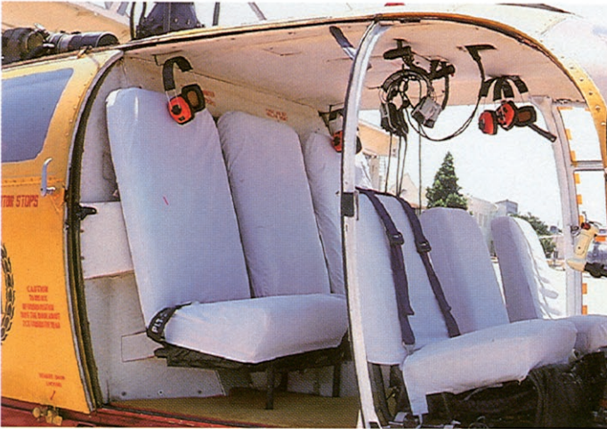
Passenger seats designed for comfort